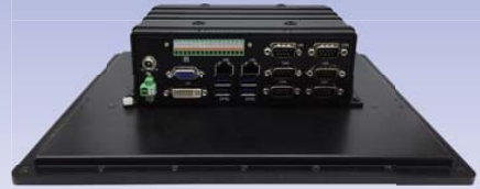
31385CW Back Panel (Option)

Feature : Fanless, Touch Screen, IP65 Front Panel Water Proof, LED Backlight panel