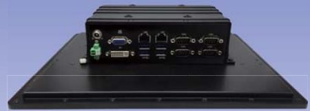
31385CW Back Panel