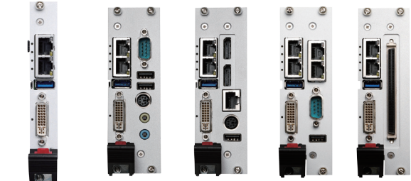
cPCI-3510(BL) cPCI-3510(BL)D cPCI-3510(BL)G cPCI-3510L cPCI-3510M