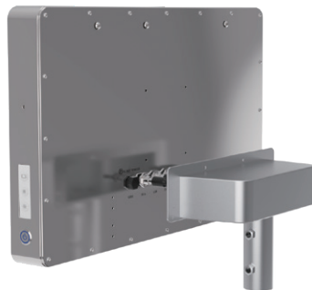
882B815A0A0E GOT821A C1D2-Cover kit (down)