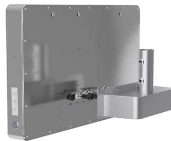
882B815A1A0E GOT821A_C1D2-Cover kit (up)