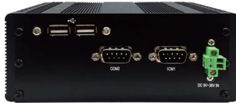
2I392CW + L2L001 Front Panel (OEM)