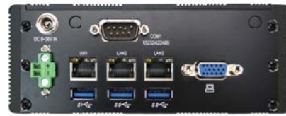
2I610DW Back Panel

M/B information: ( Please refer to M/B specification )