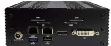
2I390CW + L2M001 Back Panel

M/B information: ( Please refer to M/B specification )