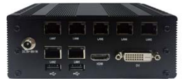
2I390CW + L2L001 Back Panel