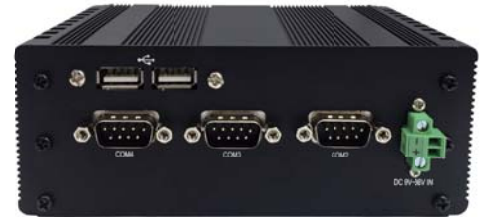
2I386EW / 2I385EW + L2M001 Front Panel (OEM)