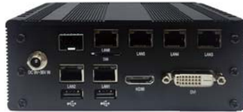
2I390CW + L2L002 Back Panel