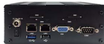
2I386EW / 2I385EW + L2M001 Back Panel