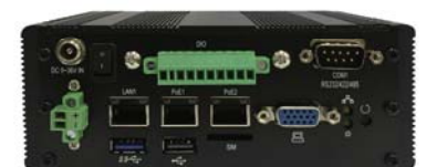
2I380NX Back Panel

M/B information: ( Please refer to M/B specification )