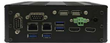
2I392CW Back Panel