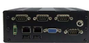
2I386EW / 2I385EW / 2I385CW Back Panel