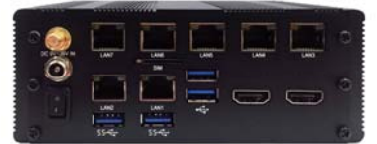
2I392CW + L2L001 Back Panel