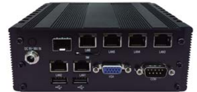
2I386EW / 2I385EW + L2L002 Back Panel