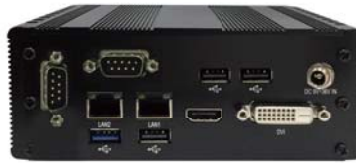
2I390CW Back Panel