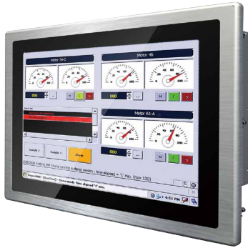
Real Flat Panel Mount (IP65 front side)