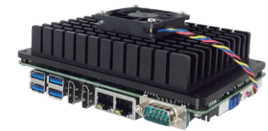
IB918 heatsink with fan